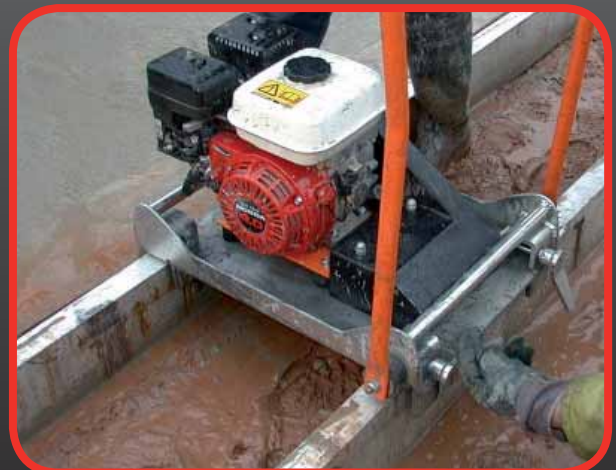
'Quick clamp' System For Tool Free On Site Assembly