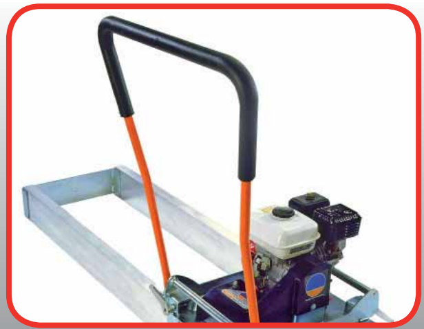
Low Hand-Arm Vibration Comfort Handles