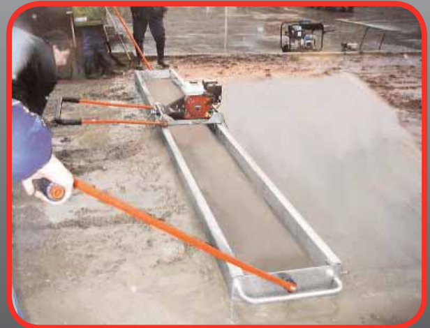
Capable Of Screeding Areas Up To 7.2 Meters